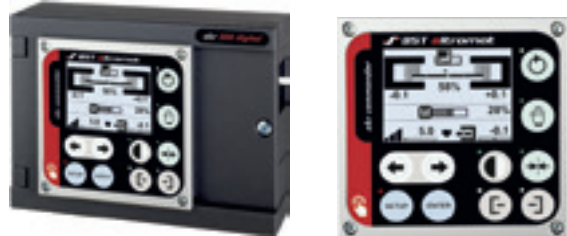
ekr 500 digital Unit Touch and ekr commander

Due to either the conditions of the machine or production requirements, it may be necessary for the web position to be corrected at a location distant from the actuator. An electronic remote control permits correction of web position and operation of basic functions from any place in the machine. According to the basic ekr 500 digital Unit Touch, this function is handled by a second ekr commander.